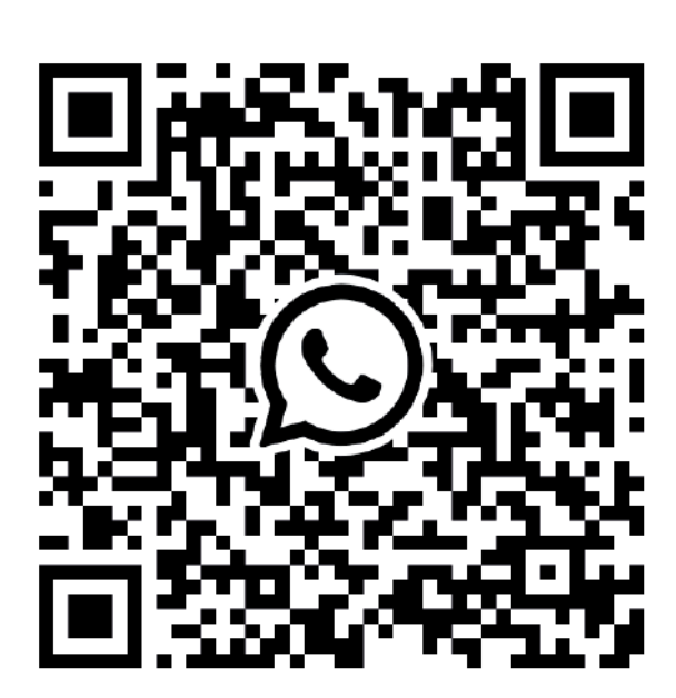
Click or Scan to Whatsapp